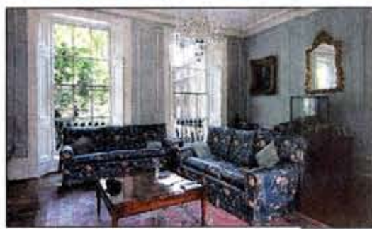
Des res: the spacious interiors of 29 Connaught Square, where other residents hire private security guards at weekends