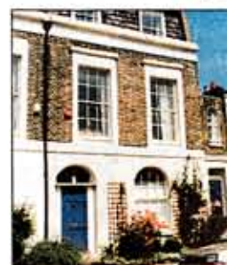
Upwardly mobile: Mapledene Road, Hackney, and their constituency home in Trimdon. In London they lived in Stavordale Road, Islington, Richmond Avenue, and now Connaught Square