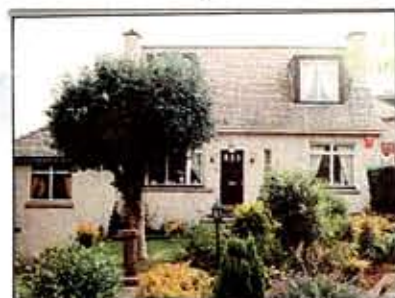
Ideal homes from the early years (from left): Paisley Terrace, Edinburgh; Providence Row, Durham; High Shincliffe, Durham; Ifield Road, Earls Court, West London

When he graduated and moved to London in 1975, he shared a string of rented flats: a basement at 92 Ifield Road, Earls Court, followed by a flat